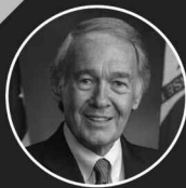
U.S. SENATOR EDWARD J. MARKEY

My father, a union leader, always said that you can't beg for your right, you have to take them. I am with you as you fight for your rights. Thank you.