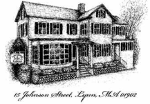
15 Johnson Street, Lynn, MA 01902