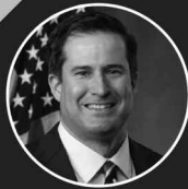
CONGRESSMAN SETH W. MOULTON

As I continue working in Washington to strengthen worker protections in our labor laws, know that I am standing alongside you in this fight. Thank you and keep up the good fight.